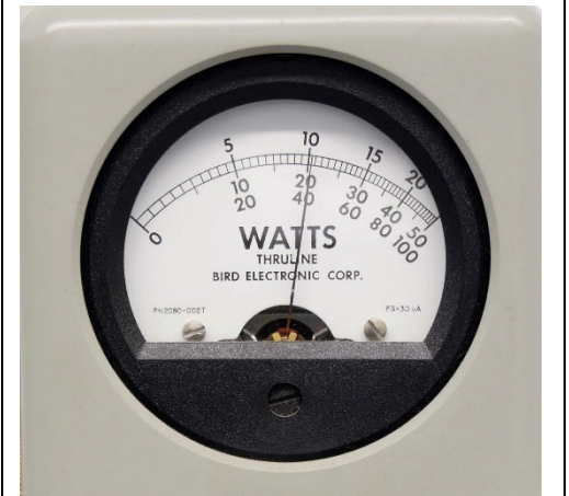
Cable length: 50 cm