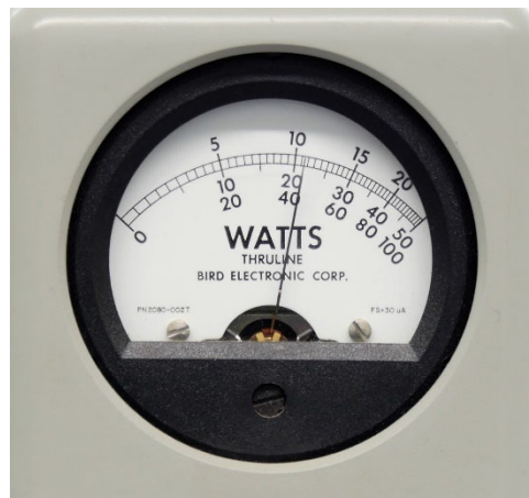
Cable length: 40 cm