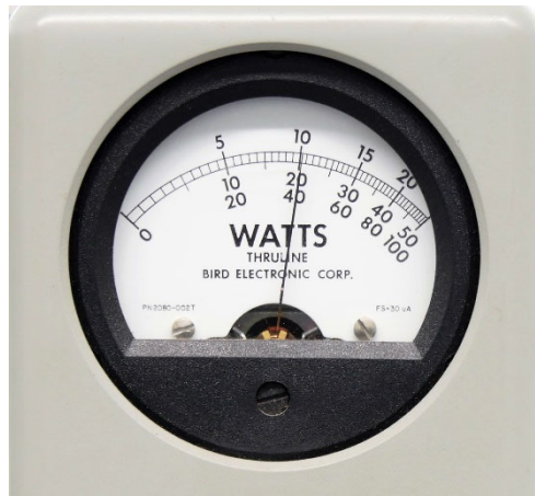
Cable length: 20 cm