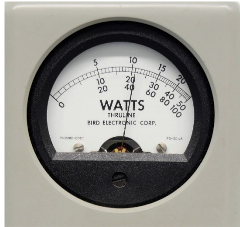
Cable length: 30 cm