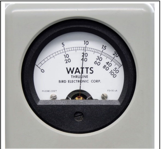
Cable length: 10 cm